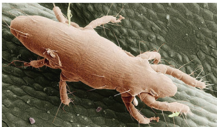
Figure 1. Close-up of oak leaf itch mite.

Oak leaf itch mites emerge from the gall folds in late July and continue through late fall on pin oak trees infested with the oak marginal leaf gall folder. The mites eventually