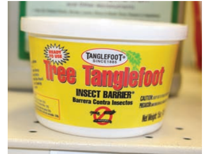
Figure 4. Tree Tanglefoot.

There are very few strategies to prevent oak leaf itch mite bites. Repellents used to prevent bites from mosquitoes, chiggers, and ticks are not effective against the oak leaf itch mite. Miticide (acaricide) spray applications do not reach mites protected within the leaf folds of pin oak trees. One prevention strategy is to apply a sticky substance known as Tree Tanglefoot (Figure 4) in a 2-inch band about 5 feet from the base of affected trees. This product acts as a barrier, capturing the mites as they move up pin oak trees to reach the folds.