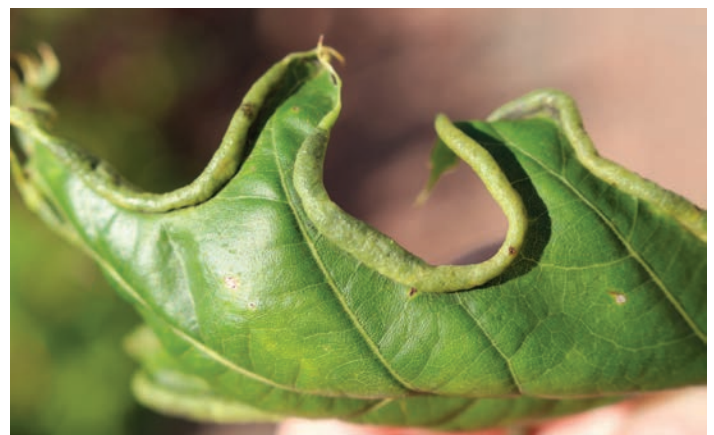
Figure 2. Folds caused by the oak marginal leaf fold gall-former.