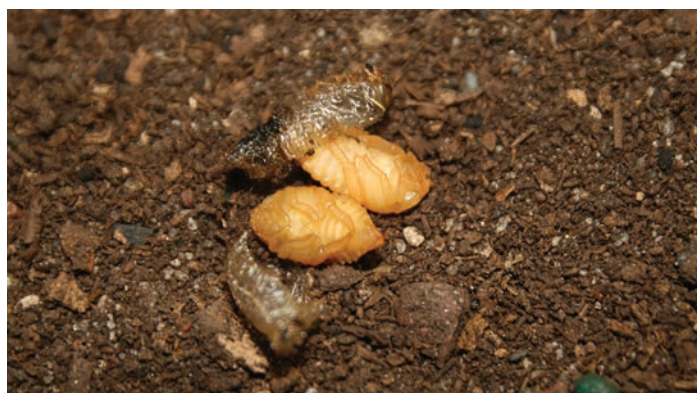
Figure 7. Japanese beetle pupae.

in the soil where they pupate (Figure 7). In about two weeks, the pupae become adults and emerge from the soil. Japanese beetle overwinters as a third-instar larva located about 2 to 8 inches beneath the soil surface, depending on the soil type. There is one generation per year.