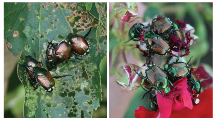
Figures 8 and 9. Japanese beetle adults feeding on linden leaf (left) and rose flower (right).

Japanese beetle adults feed on more than 300 plants. These include rose, linden, crabapple, willow, Virginia creeper, purpleleaf plum, Norway maple, and American elm. Table 1 lists the ornamental plants that are susceptible to Japanese beetle adults. Adult beetles congregate on leaves and flowers (Figures 8 and 9) and mainly feed on the upper leaf surface, creating irregularly shaped holes (Figure 10). On highly susceptible plants, Japanese beetle adults will feed on the leaf tissue between the veins, which results in