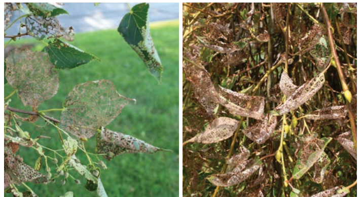
Figures 11 and 12. Japanese beetle adult feeding damage on littleleaf linden leaves (left) and pussy willow (right).

Population management should begin after larvae emerge from eggs when they are small and near the soil surface. A number of soil-applied insecticides are available for managing Japanese beetle larval populations. Many products should be applied four weeks before larvae emerge from eggs to ensure insecticide residues are present in the soil when larvae are small. Larger larvae can be difficult to kill with most soil-applied insecticides, thus requiring treatment with trichlorfon (Dylox). Soil-applied insecticides become less effective as larvae migrate deeper into the soil to overwinter.