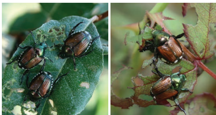
Figures 2 and 3. Japanese beetle adults feeding on viburnum leaf (left) and rose leaves (right).