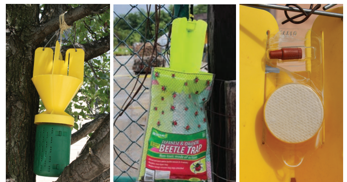
Figure 13. Japanese beetle adult traps (left and center). Figure 14. Floral food lure (bottom right) and synthetically-derived sex pheromone (top right).