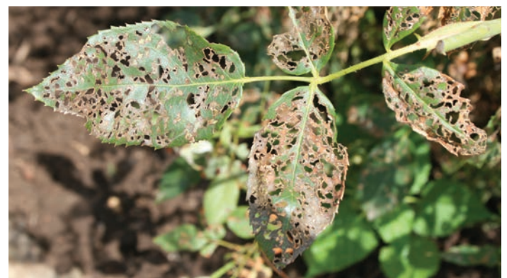
Figure 10. Japanese beetle adult feeding damage on rose leaf.