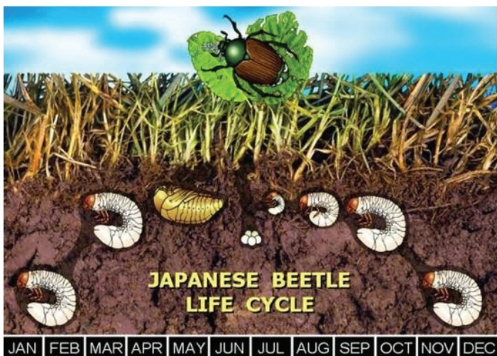
Figure 1. Japanese beetle life cycle.

In approximately two weeks, the white, C-shaped, \frac{1}{16} -inch (2 mm) long larva emerges (ecloses) from the egg and progresses through three larval stages (instars) before reaching maturity. The third-instar larva, which are 1 to 1\frac{1}{8} inches (25 to 28 mm) long (Figure 5), causes the most