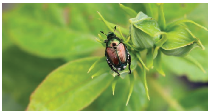
Figure 4. Japanese beetle adult with five white tufts of hair on each side of the abdomen and two on the end of the body.