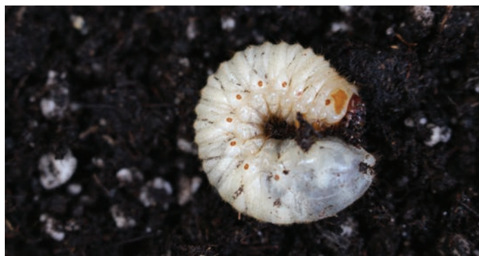
Figure 5. Japanese beetle third-instar larva or grub.

Japanese beetle larvae have a distinct rastral (setae) pattern on the end of the last abdominal segment consisting of two rows of short spines in a V-shape surrounded by a random arrangement of spines (Figure 6). When the soil is moist early in the summer, larvae are located near the soil surface. However, as soil dries, larvae migrate deeper into the soil. They eventually move upward and resume feeding when the soil is moist. In late fall, larvae migrate down deeper into the soil when soil temperatures are below 60°F (15°C). As soil temperatures increase in the spring, larvae move closer to the surface and begin feeding on the roots of turfgrass and other plants. In late spring, larvae create a cavity