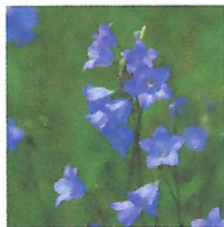
Campanula rotundifolia Bellflower Family