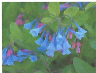
Mertensia virginica , Borage Family

Common names are "nicknames", varying by country, region or even city versus rural! A plant may have many different common names. Or, adding to the confusion, many different plants may have the same common name. If the exact identity of a plant is important to you, you must know the botanical name. For example, if you tell a gardener that you bought some Bluebells, we still don't know which plant you have because so many plants are called "Bluebells".