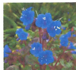
Phacelia minor , Borage Family