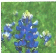
Lupinus texensis , Pea Family