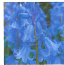
Hyacinthoides hispanica Lily Family

The botanical name is an elegant, organized system that provides vast information. For instance, Echinacea is the genus for Coneflowers. Angustifolia means "narrow leaves", and any plant with angustifolia as the species name will have narrow leaves. (I hope you know the wonderful Zinnia angustifolia , sprawling 12" tall and NEVER gets mildew. Zinnia is both the common and botanical genus name. Common zinnias are Zinnia elegans .) You already know Coneflowers like the purple Echinacea purpurea . Echinacea angustifolia is a coneflower with narrow leaves and it is the Echinacea in western Kansas where the pitiful rainfall favors narrow leaves as a strategy to survive droughts. Our MICO prairie Echinacea is Echinacea pallida , a pale pink Coneflower. Echinacea X 'Cheyenne Spirit' is a naturally occurring hybrid (hybrids are the result of two species crossing), discovered in a field at a nursery. Many would consider it a native or nativar because it's not "man-made." But now it's reproduced for sale in nurseries by cloning. Is it still a native? Botanists argue. What do you think?