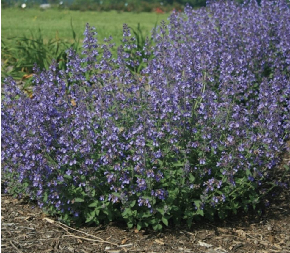
A sample of one of the plants available at the sale. Can you guess what it is? I know Lenora will know...

Will this be our best Plant Sale ever? It's in Mother Nature's hands. Could we please have four days of perfect weather?!